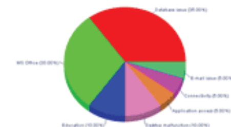
Built-in reports include charts and graphs

Service Desks are flooded with data. Often, support team statistics are difficult to keep track of and even more challenging to use effectively. That's where ServiceWise comes in. ServiceWise makes it easy to instantly communicate your most important service desk metrics to support teams and executives. It empowers your workforce with the real-time support statistics they need to do their jobs more effectively. By incorporating industry standards, built-in reports, ServiceWise makes it easy to create dazzling reports. With custom point and click reports as well as dynamic web query reporting, organizations will be armed and ready for even the most challenging reports.